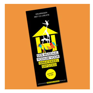
A museological podium for intangible heritage: experiences with cocreation

Publication of the translation in German language of the 'Teaching and Learning with Living Heritage: Resources for Teachers'