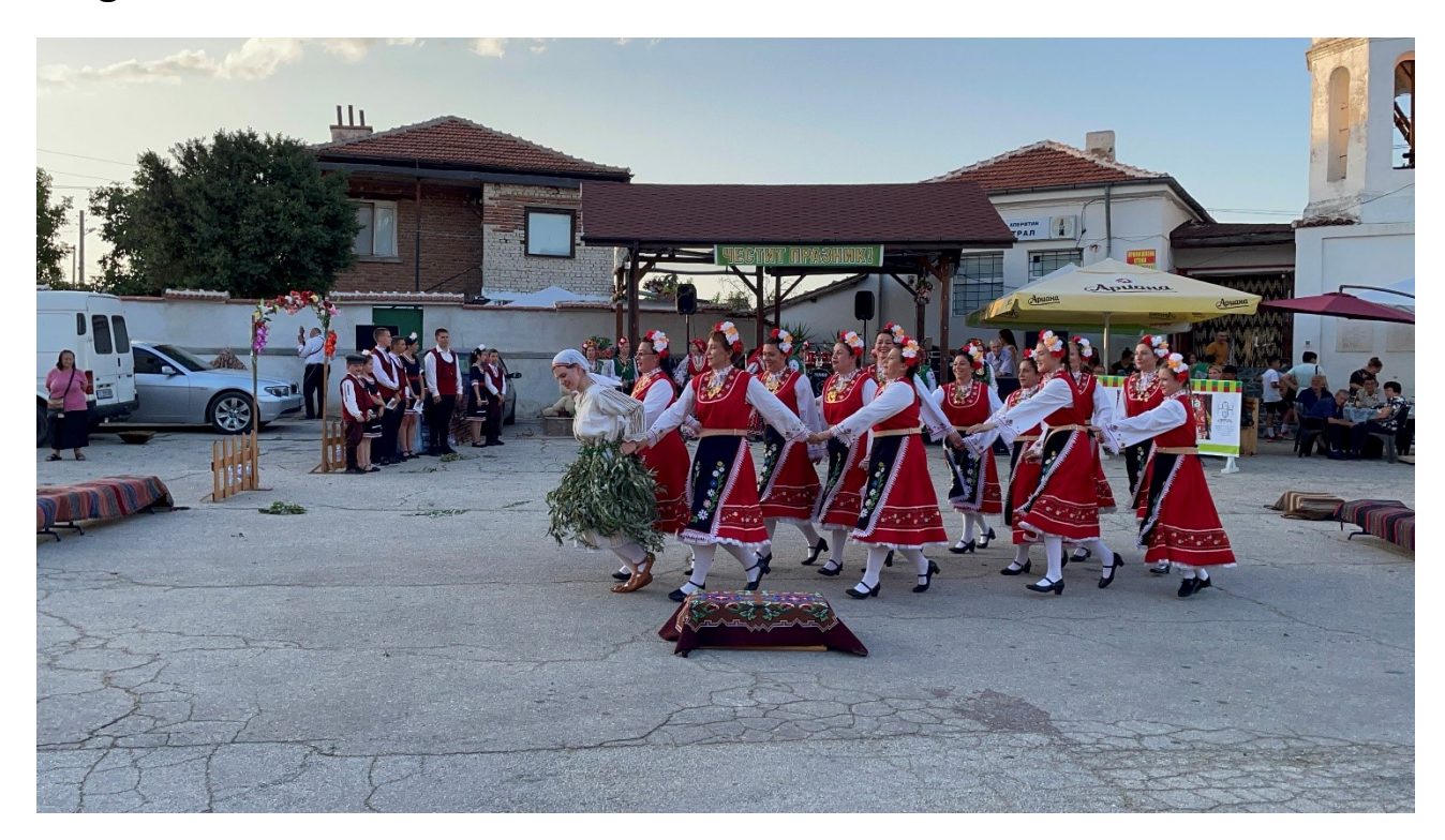
It's a ceremonial rain-summoning ritual that takes place in the summer on certain dates or during period of drought