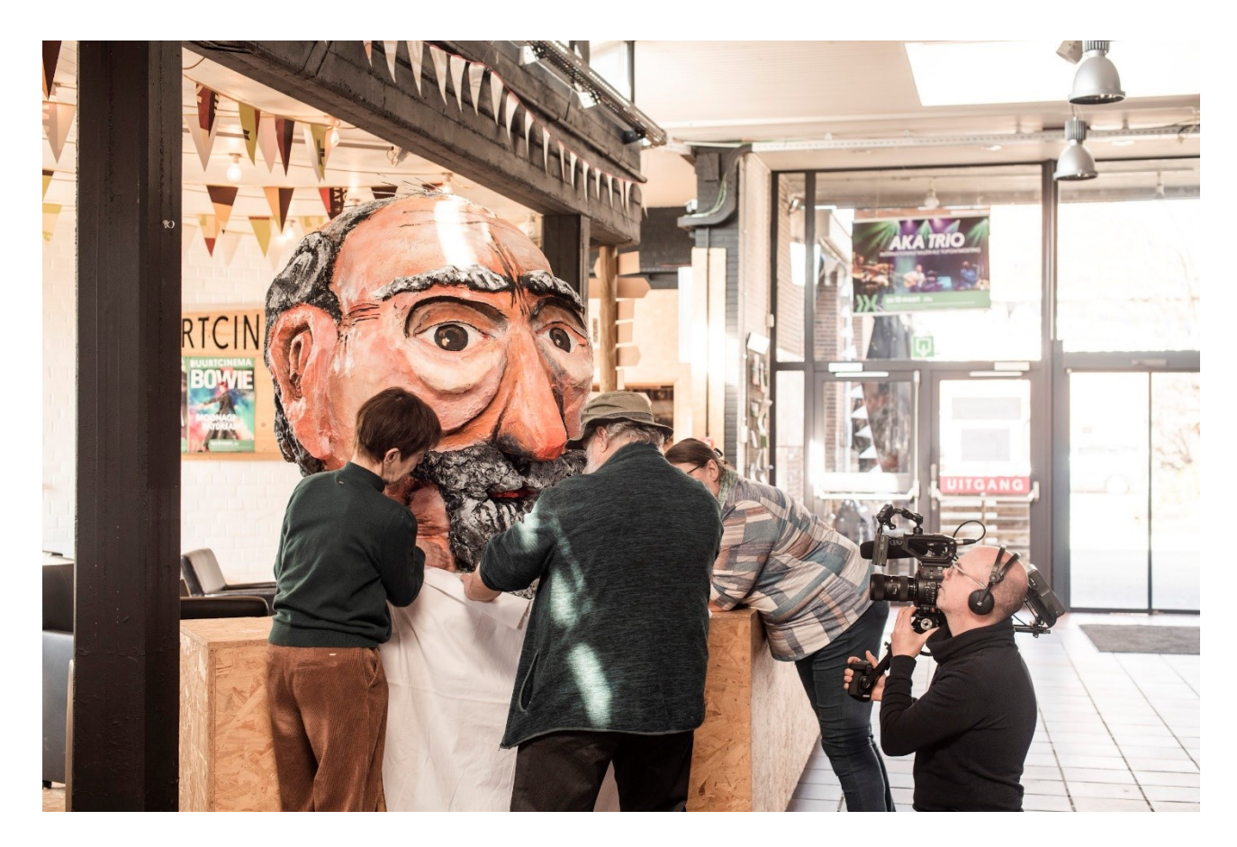
Filming of the living heritage of making a giant in Flanders

This image depicts the filming of practices related to processional giants and dragons in Belgium and France. The living heritage linked to the giants culture and manifestations are widely practiced until today in <u>Belgium</u> and <u>France</u>, and it is also an inscribed element in the UNESCO Representative List of the Intangible Cultural Heritage.