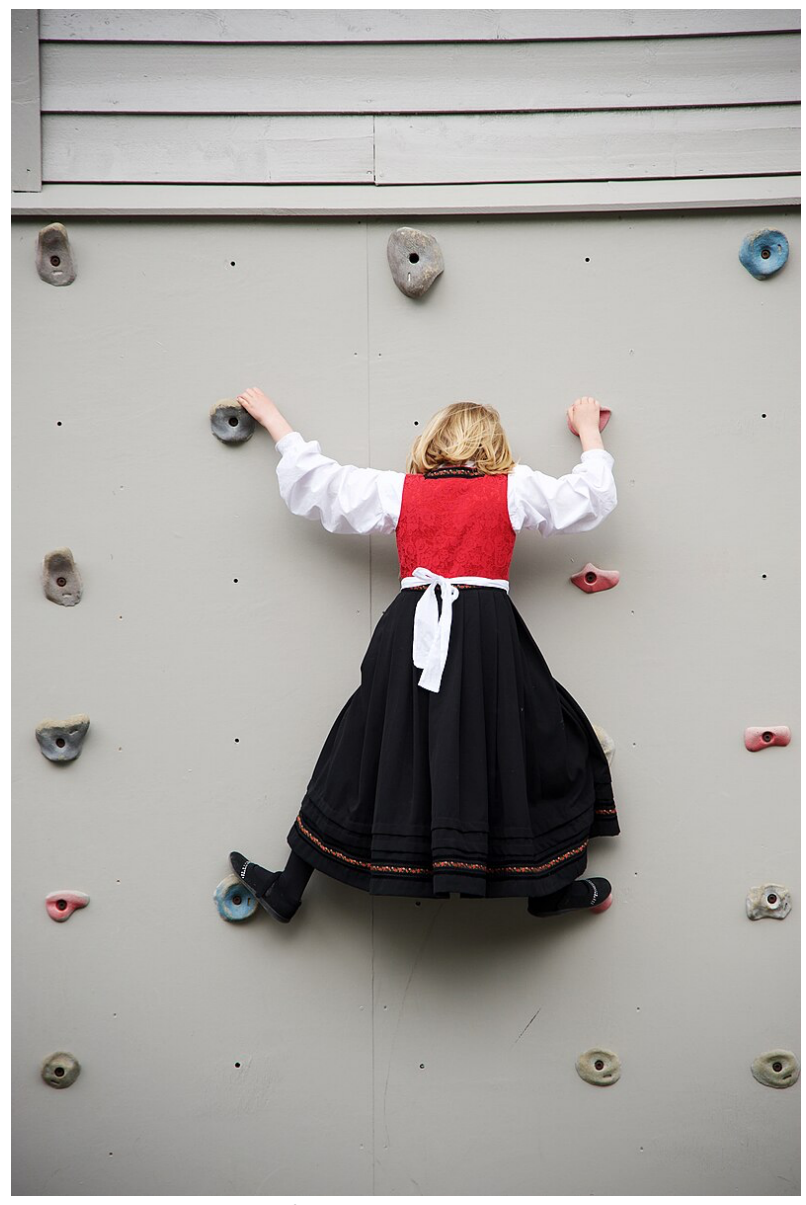
Jente i bunad klatrar på vegg i Kvam herad 17. mai 2016.

Link to the photo: File:20NYH17. mai Vikøy-6.jpg - Wikimedia Commons